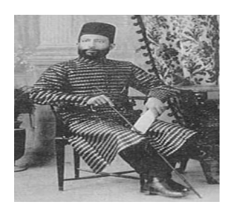
Mohammad Ajmal Khan (11 February 1868 – 29 December 1927).

The CCRUM as the apex government organization for research in Unani Medicine has been involved in research and clinical trials of Unani system of medicine.